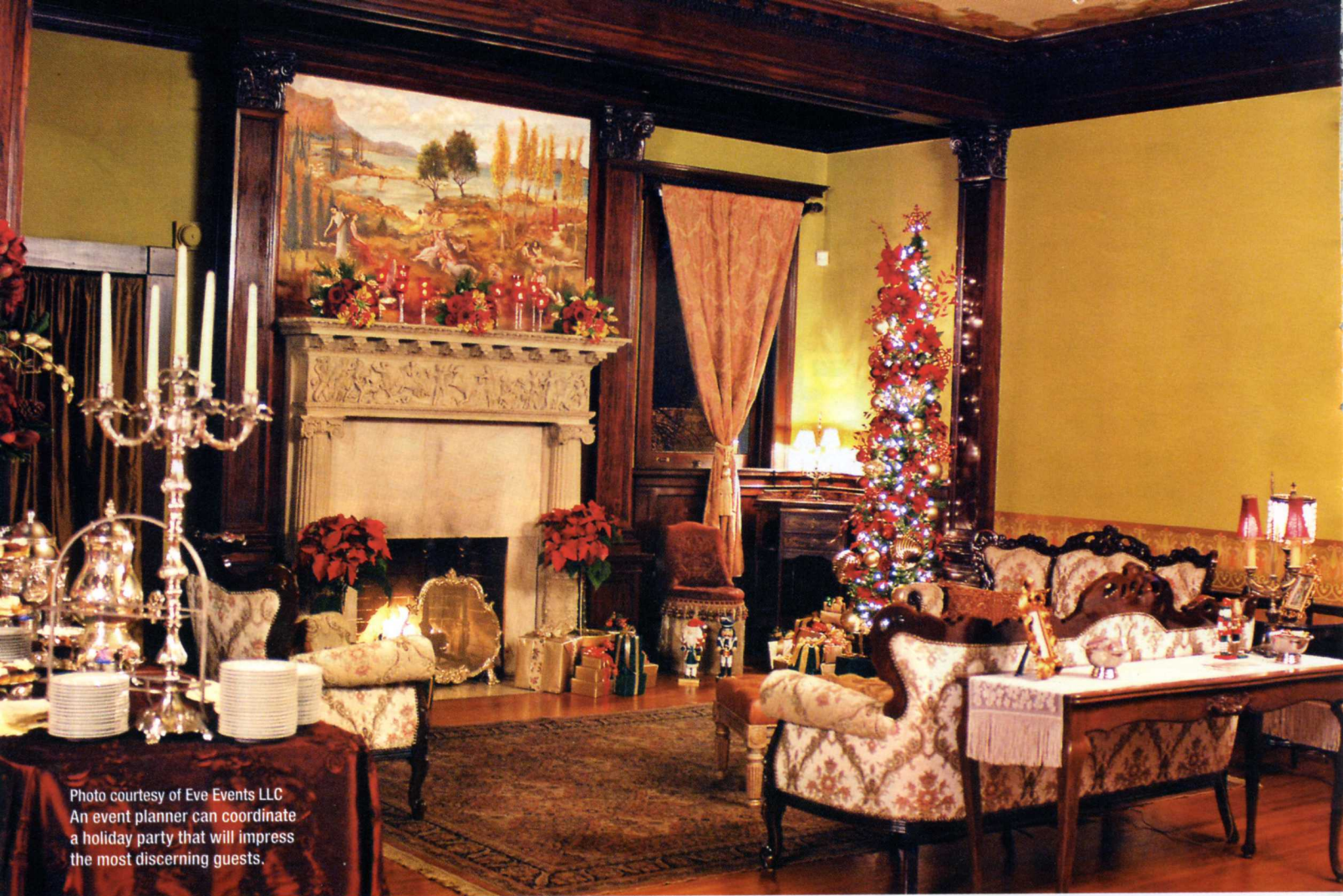
An event planner can coordinate a holiday party that will impress the most discerning guests.